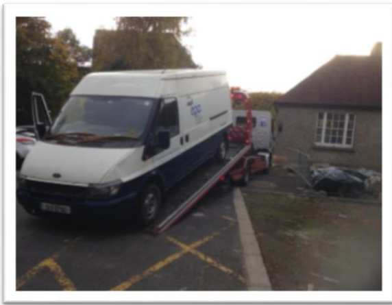
Transit rescue! One of two vans rescued from EPA carpark for repair and donation to Boomerang and Bia

One Ford Transit van with failed clutch and a Mercedes Vito van with out-of-date tax, insurance and DOE were rescued from their car park resting places. Both vans needed a significant amount of work, as much due to their time laid up on the car park as anything else, but then, "like two mighty automotive phoenixes, they rose from the ashes of despair to the sunlit uplands of new hope".